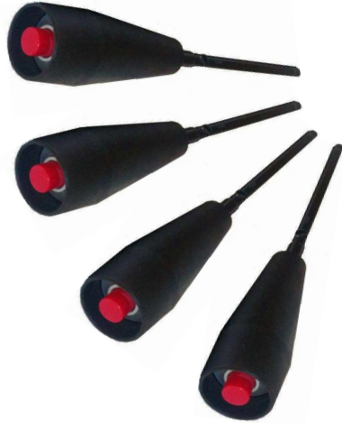
Wireless Grip Switches